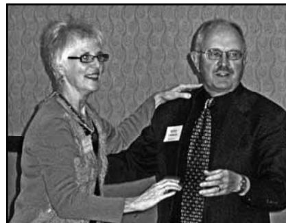
Performances, auctions, dancing, socializing and lots of fun!