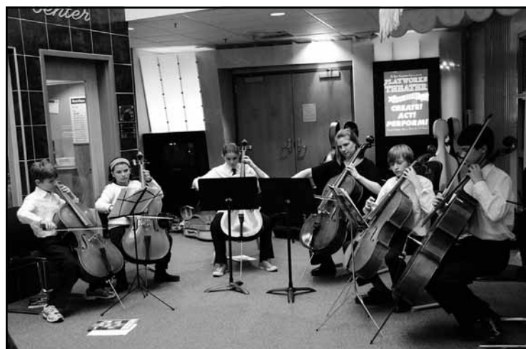
Students performing at the Children's Museum Holiday Program. Left: Junior Cello Choir; and Right: Cello Choir.