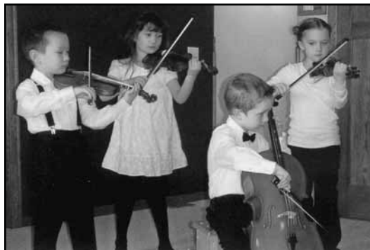
Preucil students performing at Honey Creek Cottage in Swisher, Iowa

Please contact Sonja Zeithamel at 319-337-4156 to book your next event with a Preucil Group.